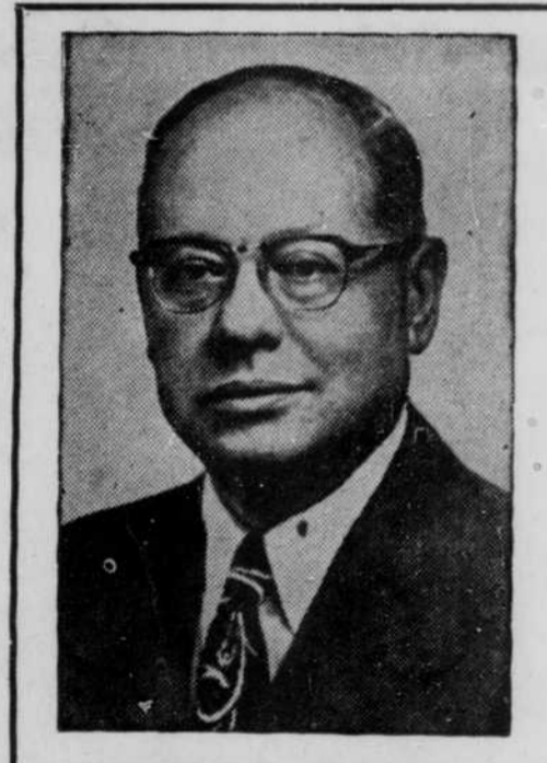
CARL T. CURTIS