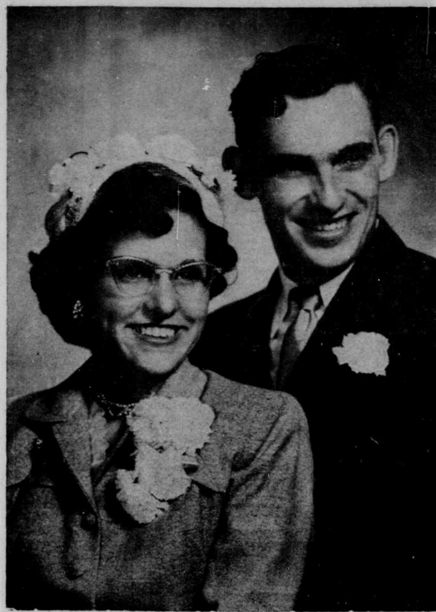
Wed in Atkinson