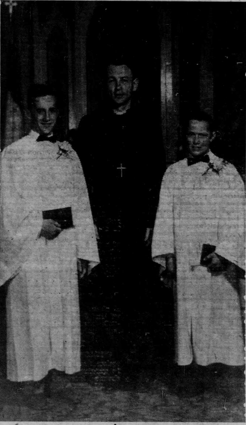
College Group to Hold Special Service—