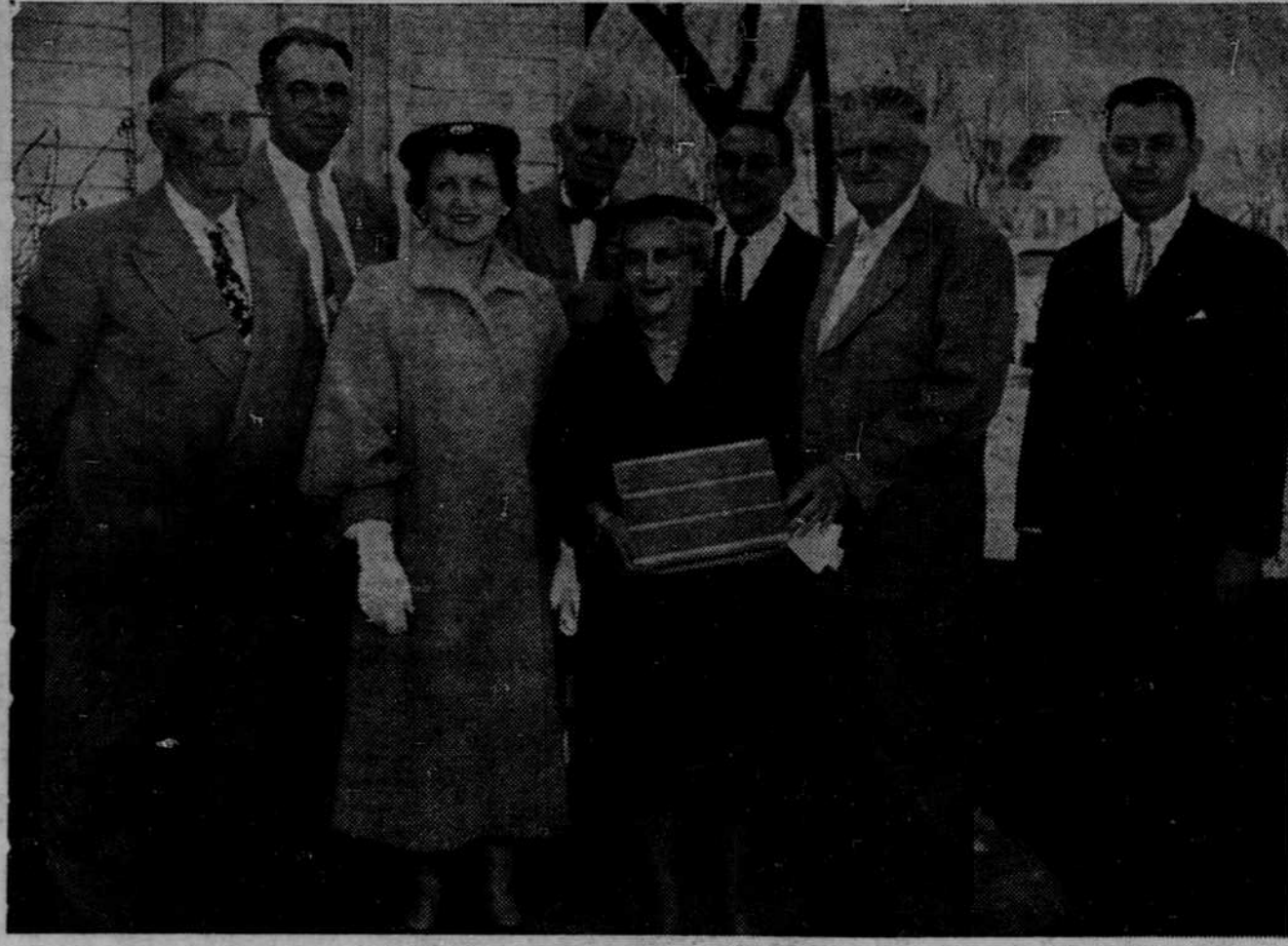
Pose with Cornerstone for New Church Unit