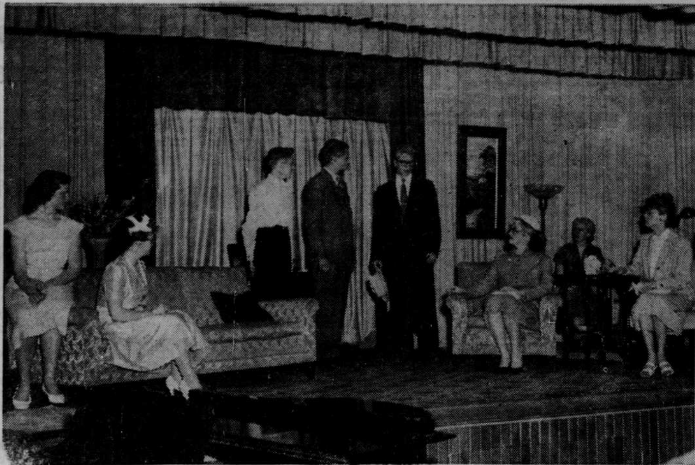
SMA Juniors Present 'Almost Eighteen'