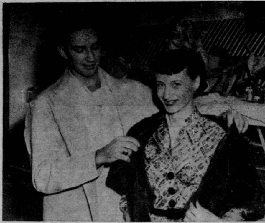
Presented Mink Stole