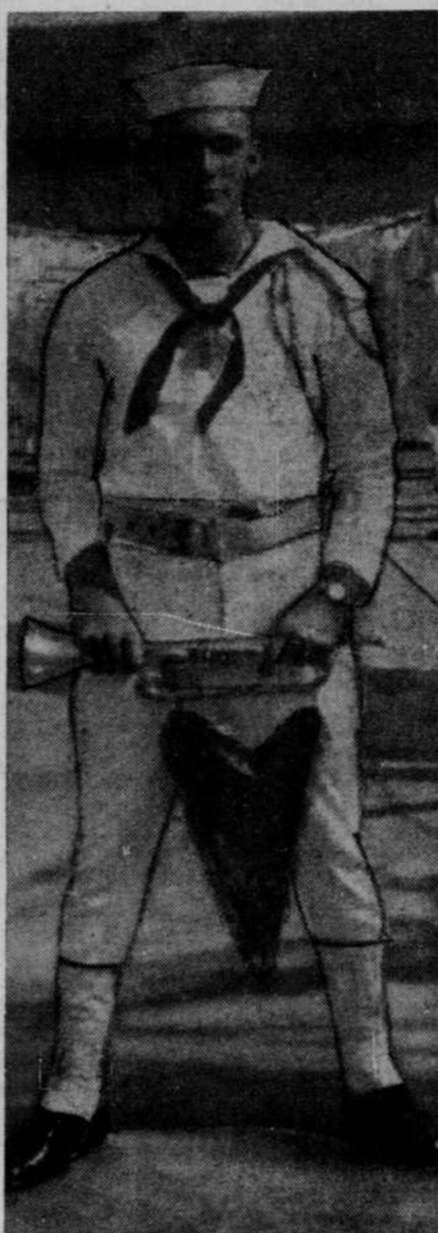
In Drum-Bugle Corps