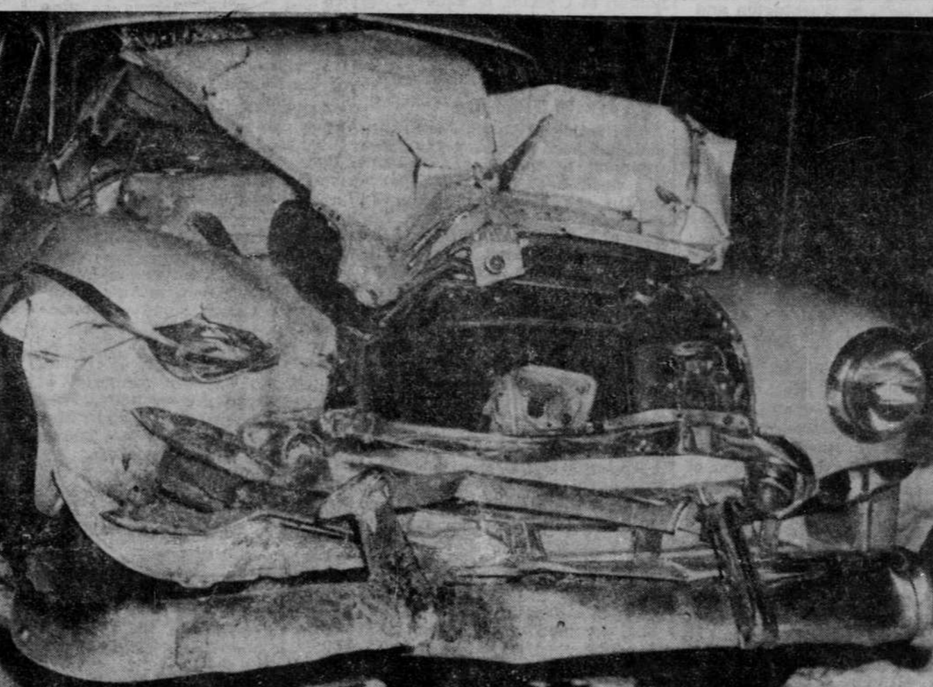
This is the wreckage in which Oscar Pruden, 53, of Clearwater was fatally injured. Pruden was driver of the car which crashed into the rear of a truck.