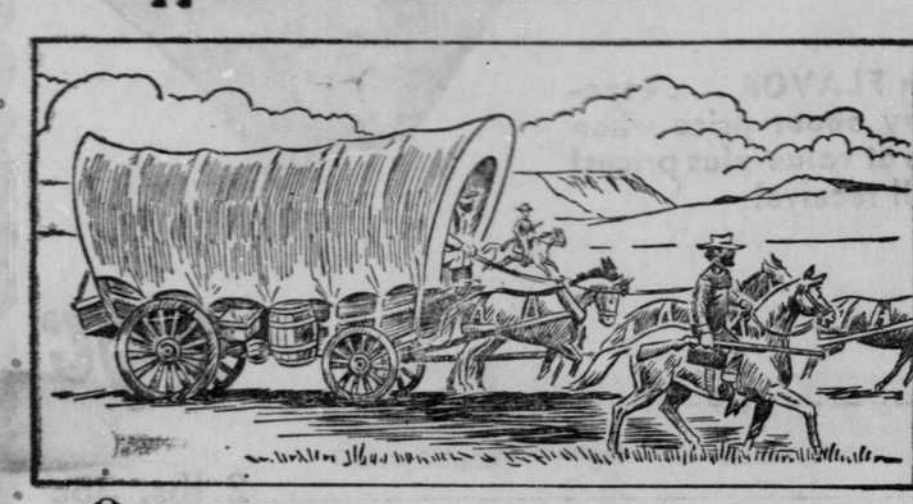
Old-time freighting was a costly operation. This picturesque Conestoga wagon, which carried from 5,000 to 16,000 pounds of freight, might cost up to $1,500. Good mules cost from $500 to $1,000 per team; harness up to $600. $7.10 per outfit!

Great as our growth in transportation since then have been Nebraska's strides in tavern management. Today's tavern operator is a respected businessman, aware of his responsibilities to customer and community.