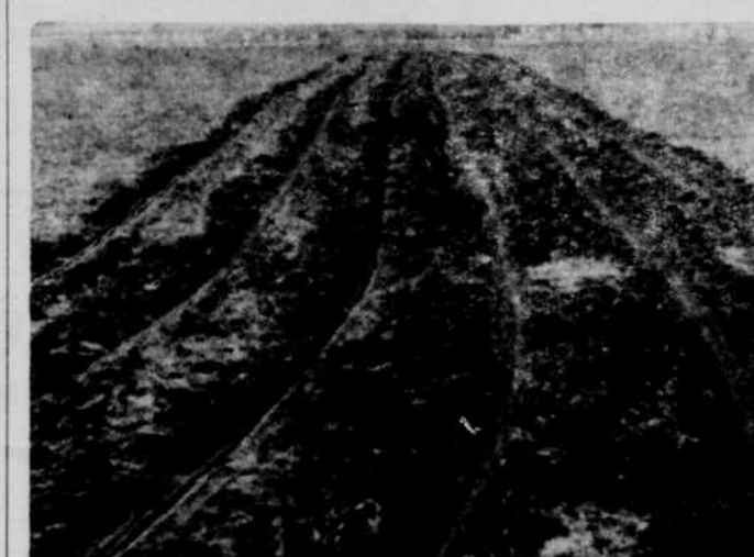
All planting operations were on the contour on the experimental range re-seeding work done by Sylvester Bahn. About one third of the sod was destroyed by the furrows, reducing the competition for the rows of grass seed which were spaced 40 inches apart.

cause of the introduction of tall grasses.