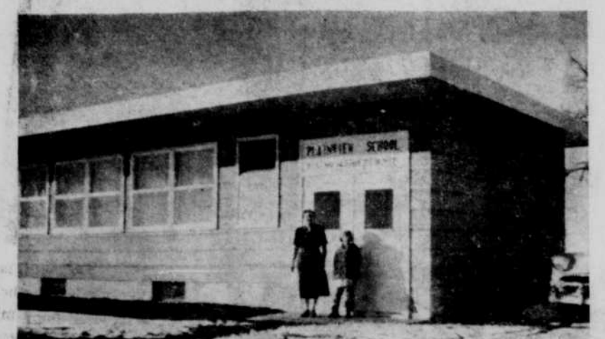
The new school was constructed for $7,500, is 20 by 44 feet and has all the modern facilities. It accommodates a 40-section area 16 miles northeast of Atkinson. The Frontier Engraving.

WAB "VOICE OF THE FRONTIER" MON. - WED. - SAT. 9:30 to 9:55 A. M.