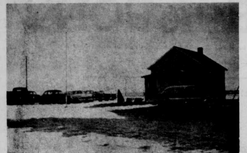
Before construction of the new District 147 one-room school, Miss Page's pupils went to school here. It is a "far cry" from the modern structure shown below. The Frontier Engraving.