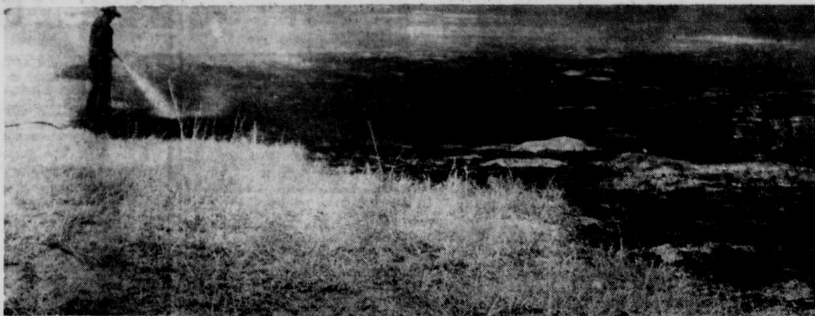
The Wolf ranch fire . . . It blacked the earth for miles.

Groups from Elgin, Bartlett, Chambers, Atkinson, Burwell and O'Neill fought with just about everything they could lay their hands