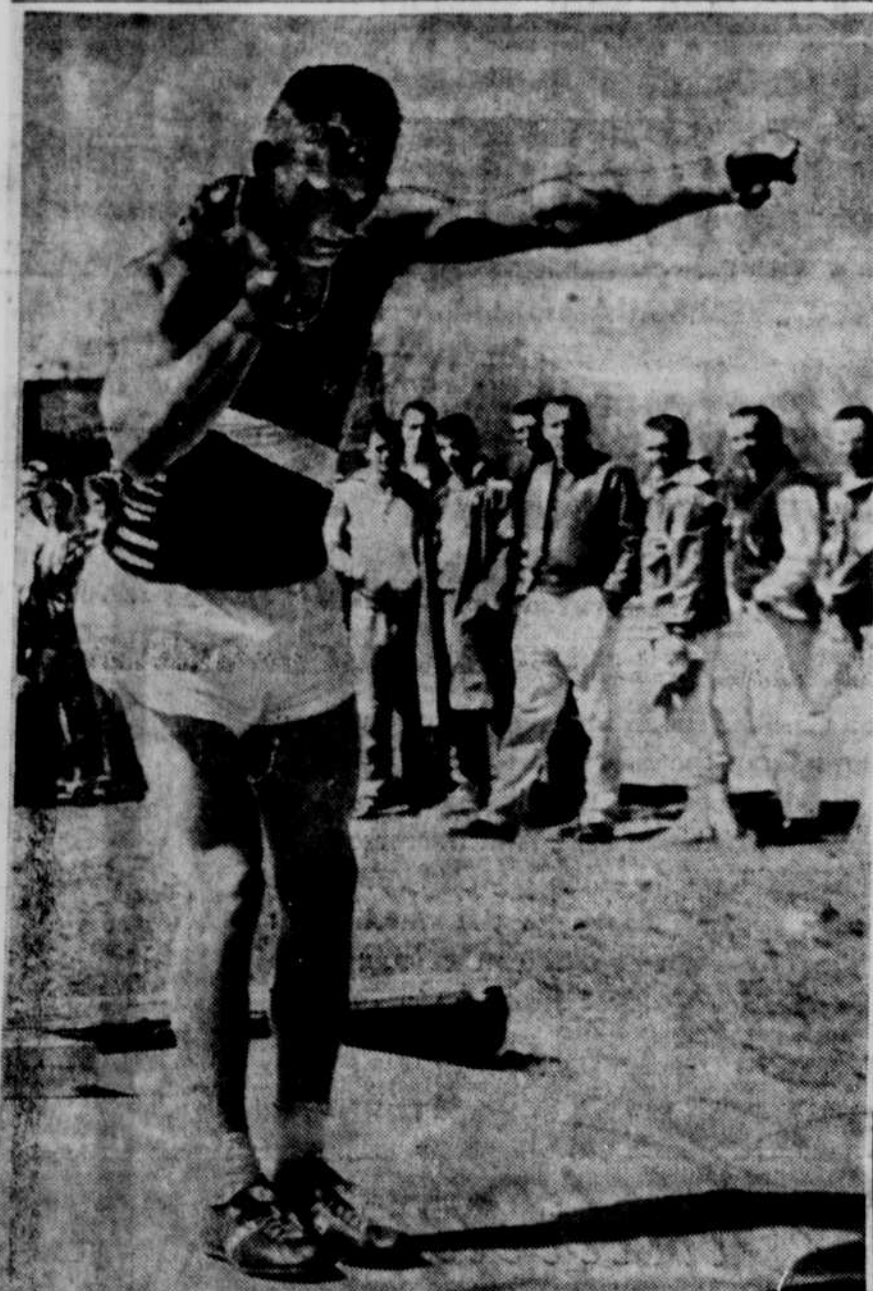
Eyes On A Winner

One method used quite successfully on the Darnell ranch fire south of O'Neill was the use of a grader pulled by a bulldozer. Deep slices of earth were overturned a few feet from the outer edge of the blaze to keep the fire from jumping.