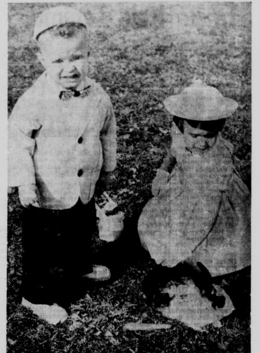
Rabbits for Fun