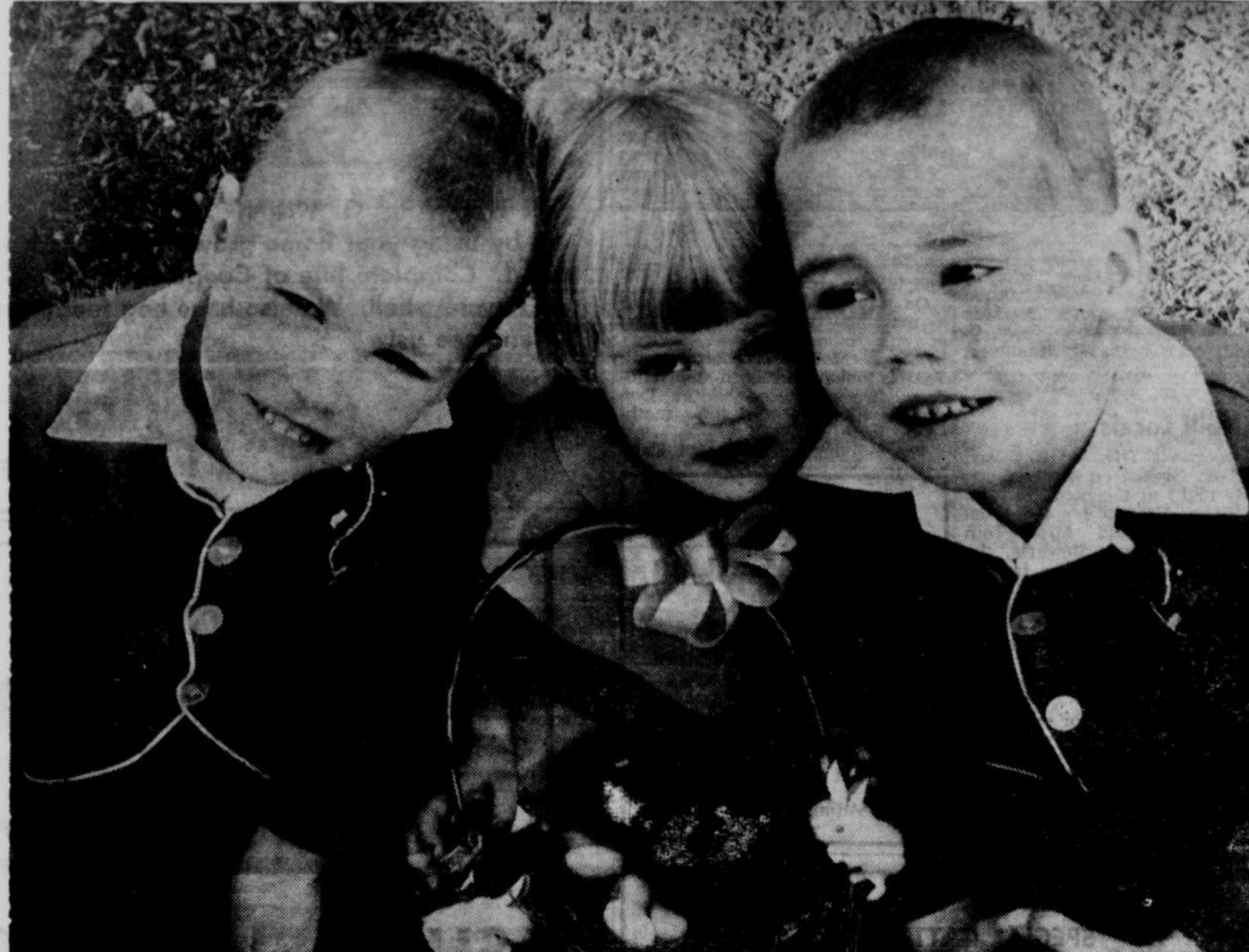
The Bunny Will Be Welcome