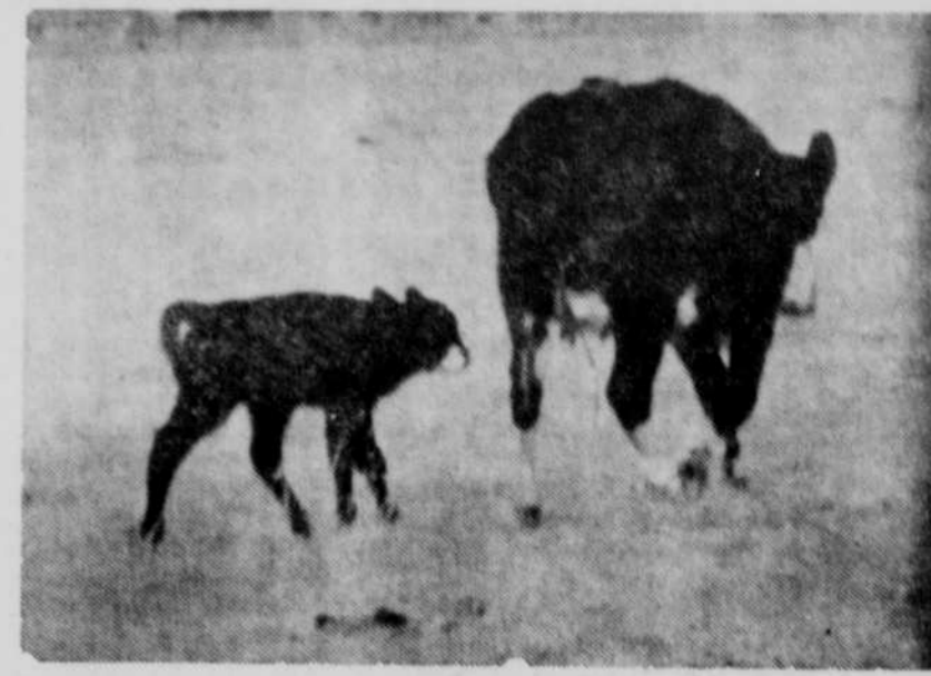
Come on Junior, let's get up...