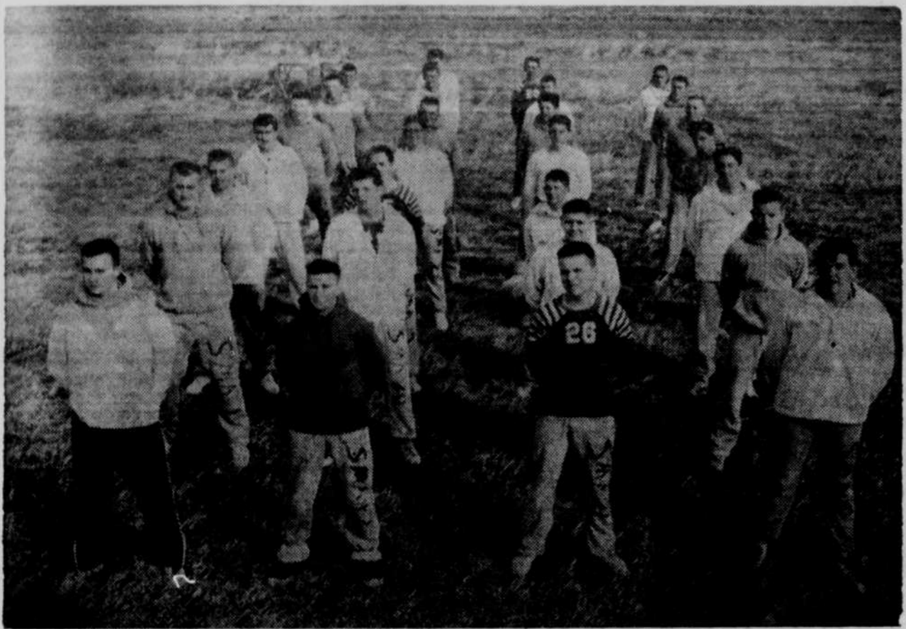
The St. Mary's Academy Squad