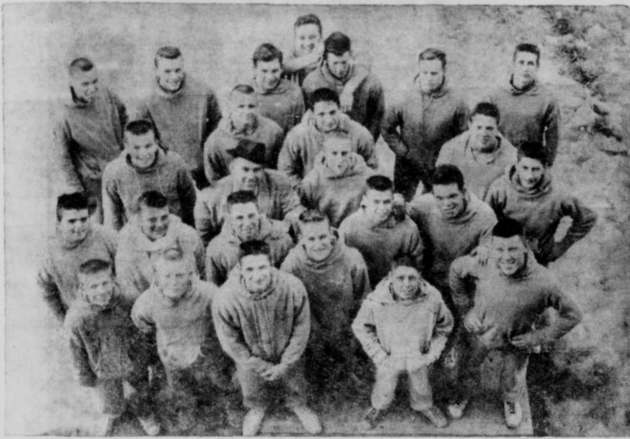
The O'Neill Eagles Squad