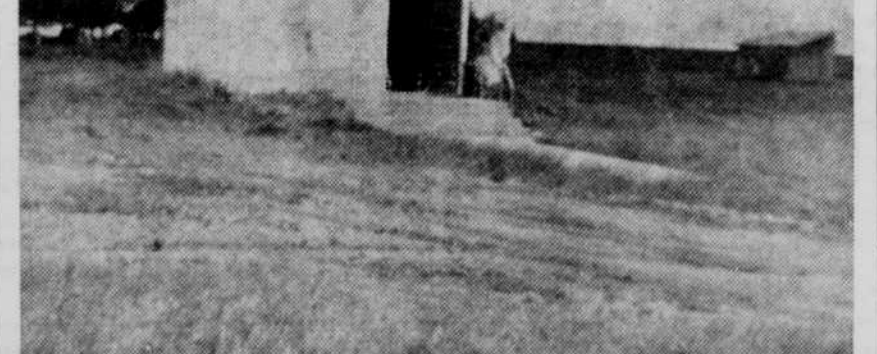
The Paddock Union church, just a short distance from O'Neill, served pioneers 70 years ago. It still stands and serves a useful purpose. Members of the congregation have refused to replace it or go elsewhere.