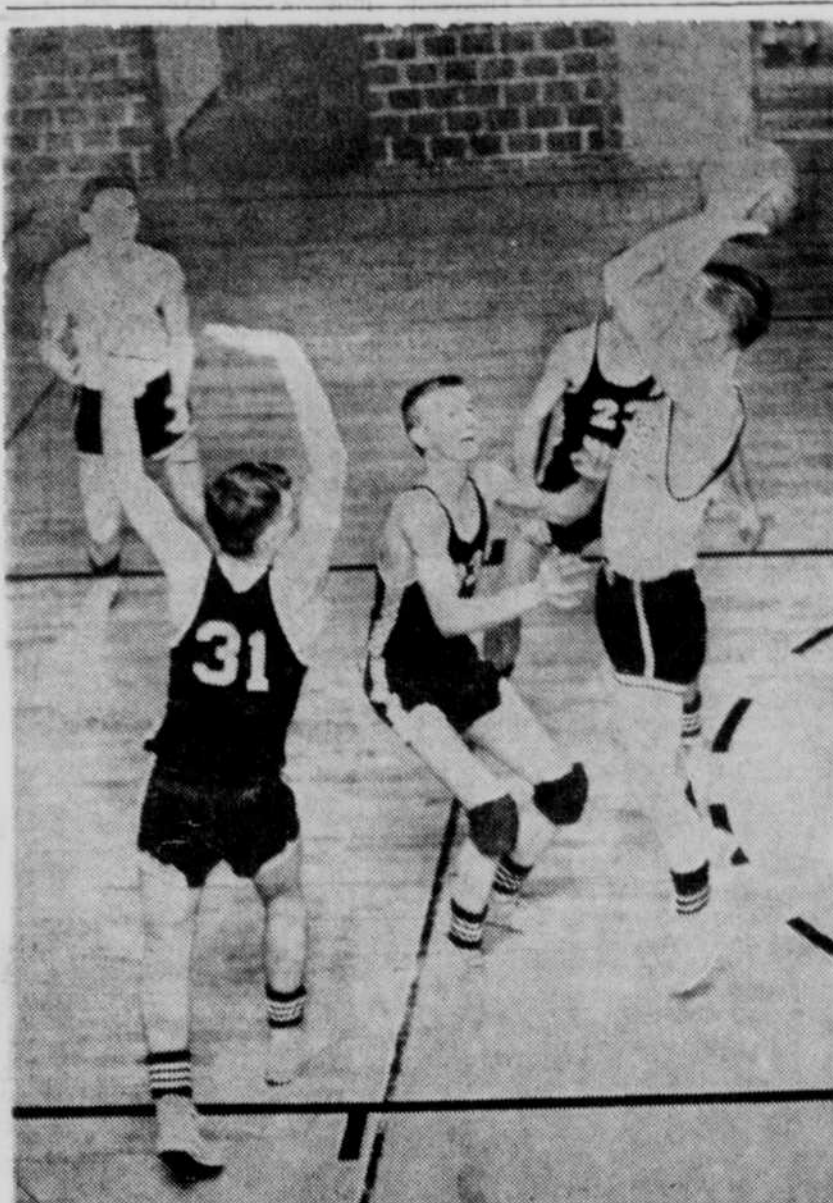
In Class D Play

The local reserves will play Valentine in the first bracket. Other teams in the conference include Springfield, Ainsworth, Long Pine, Woodlake, Bassett, Stuart and Atkinson.