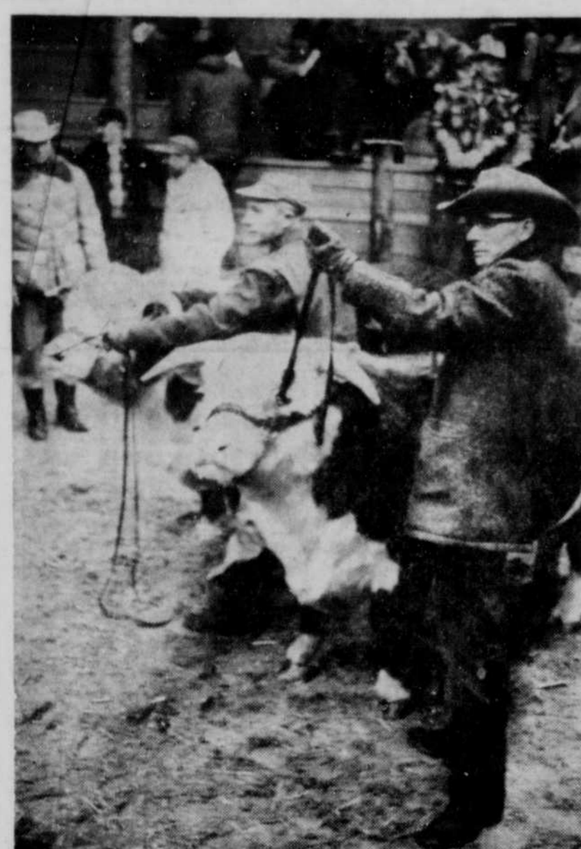
The Grand and Reserve Champions