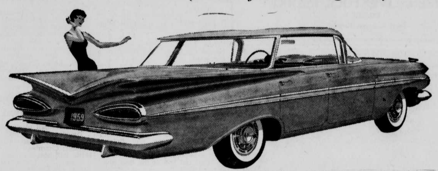
The bright new Bel Air 4-Door Sport Sedan with the same fine, fresh body styling as the most luxurious Chevrolets.