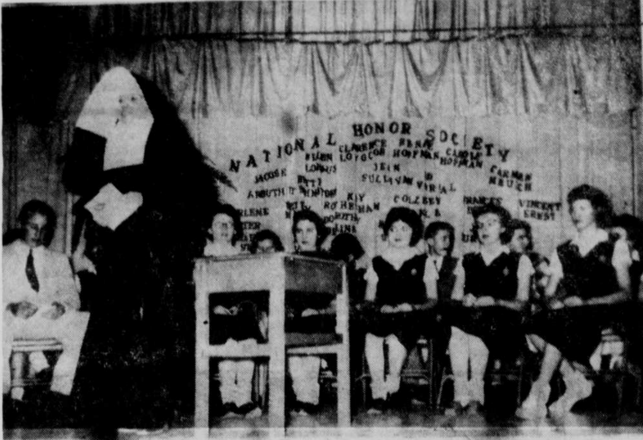
Scene at ceremony Thursday in which St. Mary's students receive National Honor society membership pins and emblems.

The grade school will have its annual Christmas program Monday night, December 22, in the St. Mary's gymnasium. The children have spent much time and a lot of work preparing for this program.