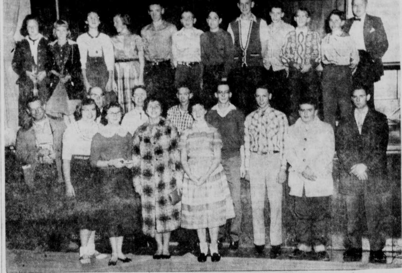
Four H'ers and leaders.. they won honors at Monday's fun night event.

Saturday Night-The Kansas-Nebraska Gas company had its Christmas party Saturday night with dinner at the Why not consider a gift sub-scription for THAT family this The O'Neill Country Club's New Year's Eve party has been cancel-led. The O'Neill Country Club's New Year's Eve party has been cancel-led. The O'Neill Country Club's New Year's Eve party has been cancel-