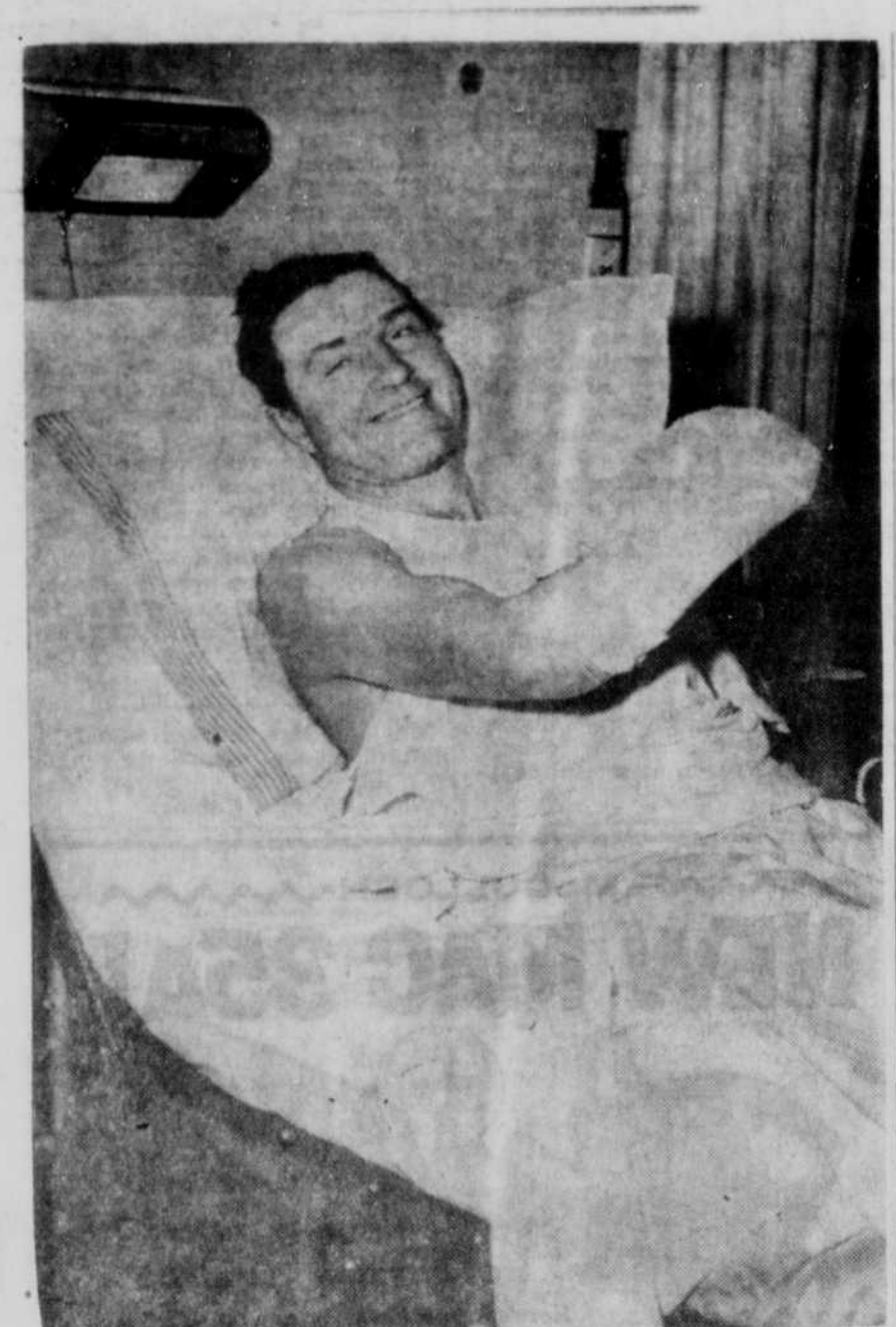
Revell . . . his foot slipped off clutch .