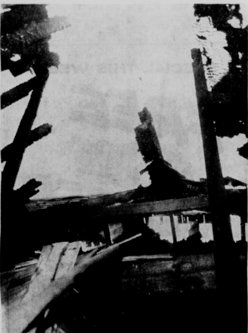
Gaping holes in the roof over the sanctuary illustrates damage done to the main portion of the Ewing church, severely damaged by Friday's early morning fire. Firemen battled flames in subzero temperatures.