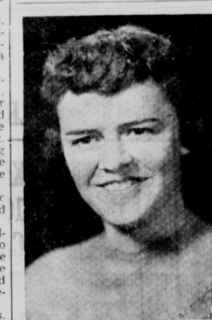
Choose December 27