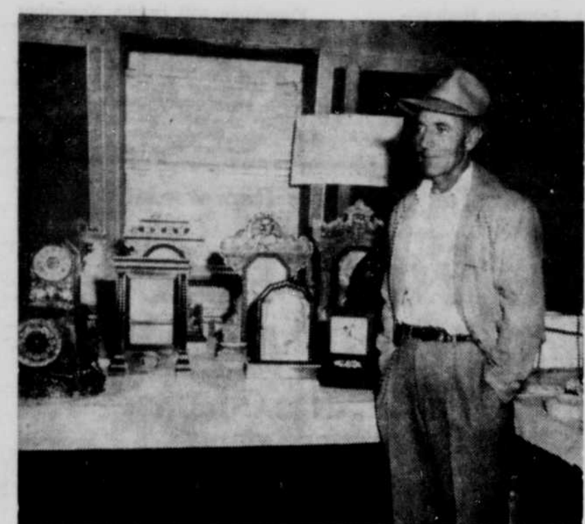
the party.