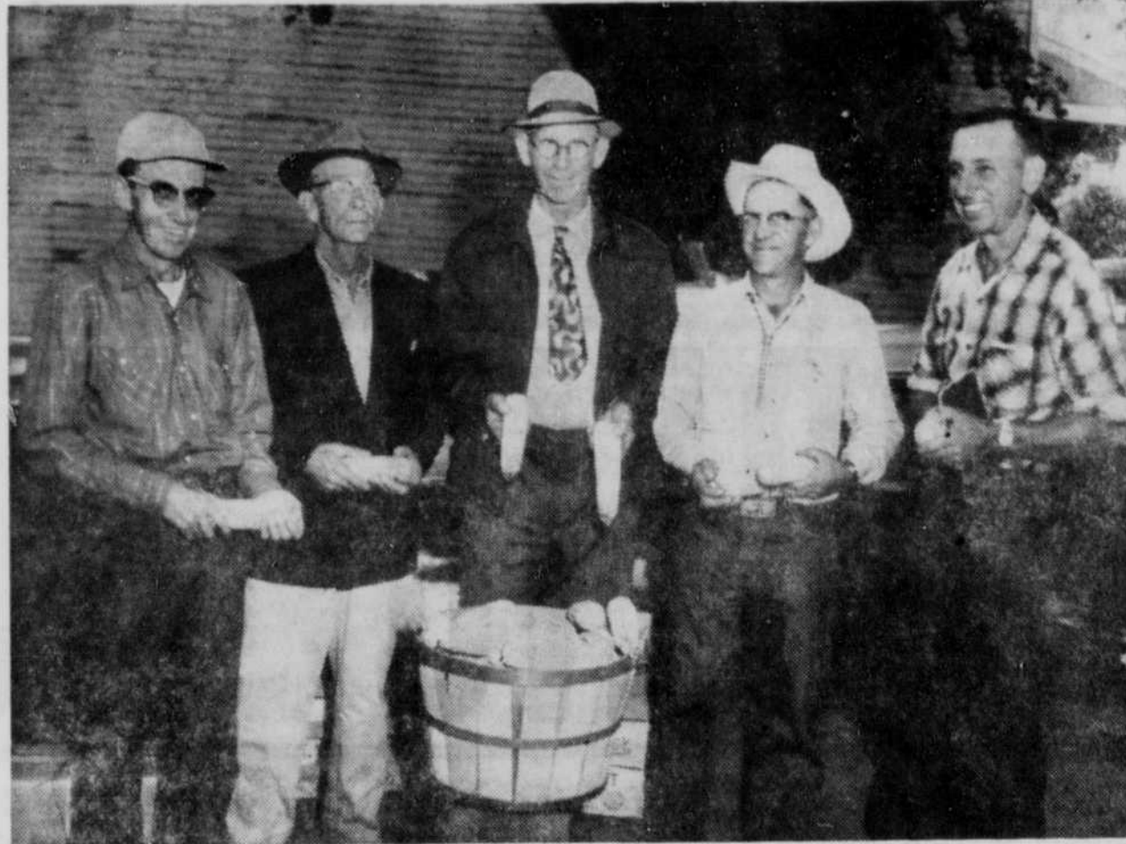
Admire Corn Specimens at Inman Fall Festival