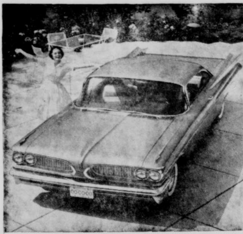
CONVEYING THE IMPRESSION of eager action is the 1959 Pontiac Catalina sport coupe. Reflecting ultra-modern design from every angle, it is destined to win wide popularity in the lower-priced, high-volume Catalina series. A wheel track nearly five inches wider for handling ease and safety, a new high-performance Tempest 420-V-8 engine, new, heavier true-contour brakes and a completely redesigned chassis frame are among Pontiac's 65 brand new features.