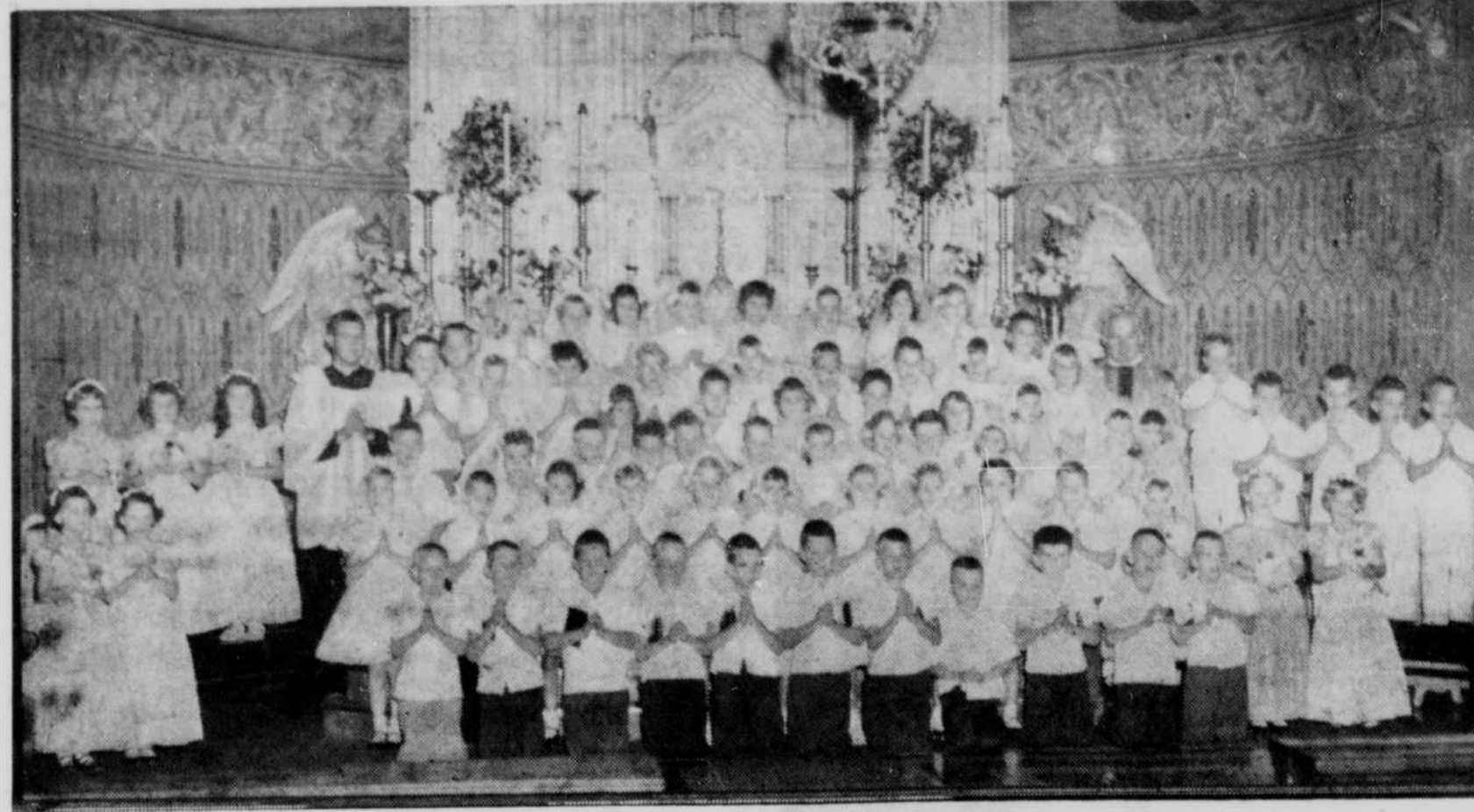
Large Class Receives First Communion