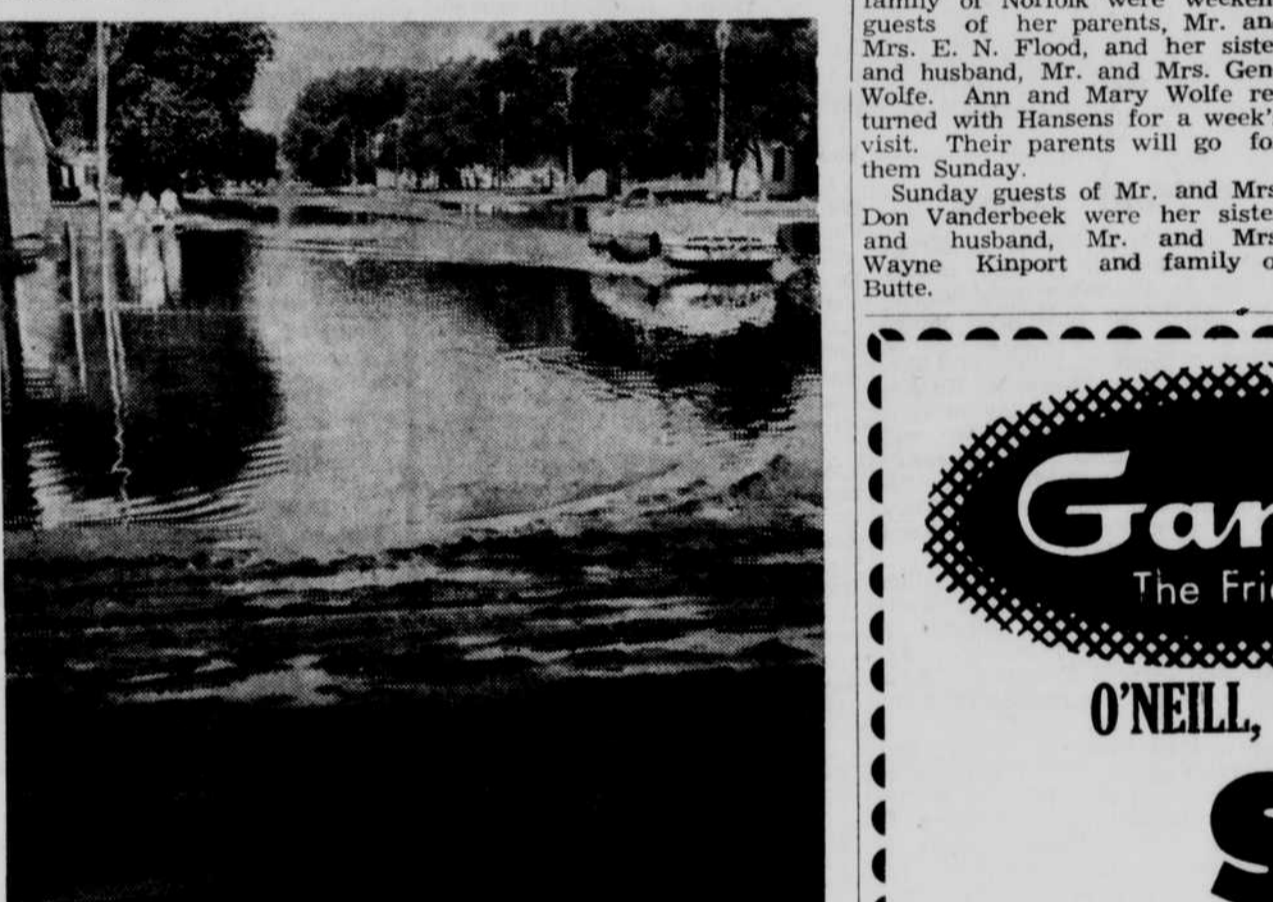
Camera looks north from Inman's main intersection. Two and a half inches of rain fell Saturday night. Picture was taken Sunday morning.