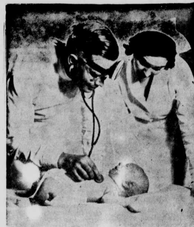
CHILDBIRTH American Republic Hospital, Surgical and Nursing Plans and the American Republic Medical and Surgical Plan help pay hospital and doctor bills for childbirth.