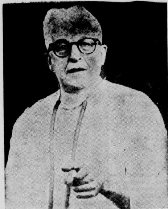
DOCTORS' BILLS The American Republic Medical and Surgical Plan helps pay doctors' bills for sickness or accident.