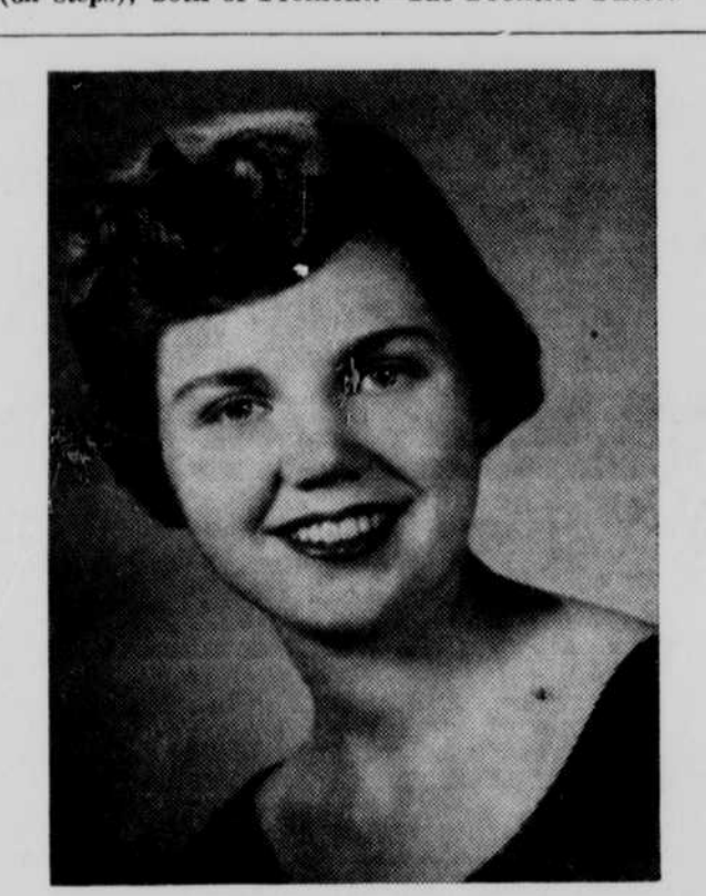
To Wed in August

view of the condition of the rails and road bed".