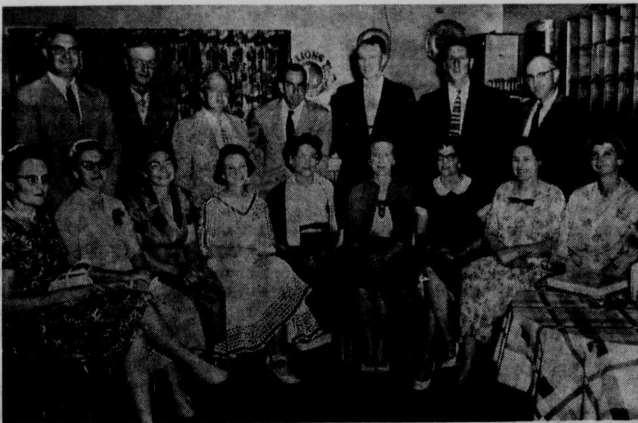
SMA Class of 1933 Reunites