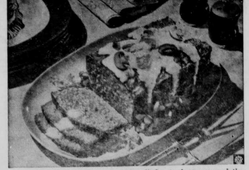
Mushroom Meat Loaf made with rolled oats, is a new variation of the ever-favorite meat loaf. Rolled oats, in addition to improving flavor and texture, add protein, valuable B-complex vitamins, minerals, and food energy at low cost.