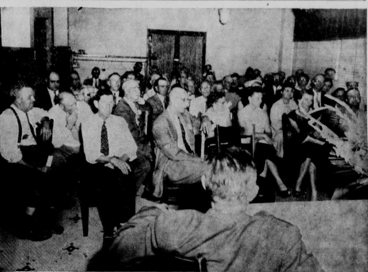
This is a partial view of the group attending Sunday's all-day meeting of the Nebraska branch of the National Star Route Mail Carriers association at the Golden. (See story on page 4.)