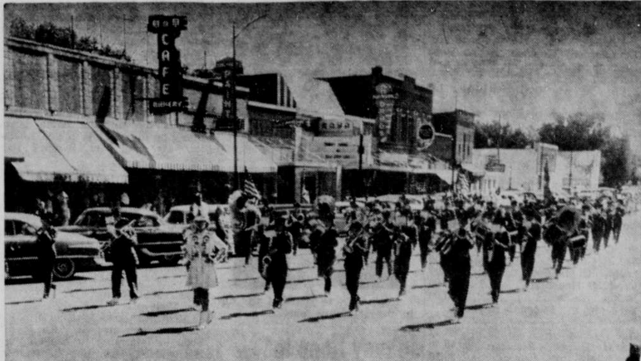
The Municipal band moves westward on Douglas street during the memorial day parade. The parade included the colors, American Legion firing squad, Legionnaires, auxiliary members, flower-girls (pictured below), Boy Scouts, national guardsmen and the guards' tank.