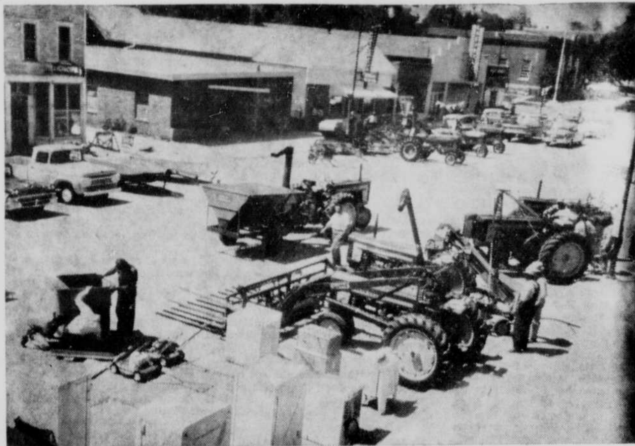
Partial View of Products Parade

The first annual products parade was held here Saturday under auspices of the Chamber of Commerce. This is a partial view of the exhibits of automobiles, farm machinery and appliances as seen from a Golden hotel window.