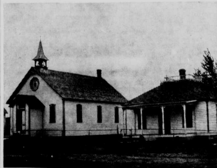
This was the original Methodist church and parsonage at Page.

ORDER direct or through The Frontier. 52c