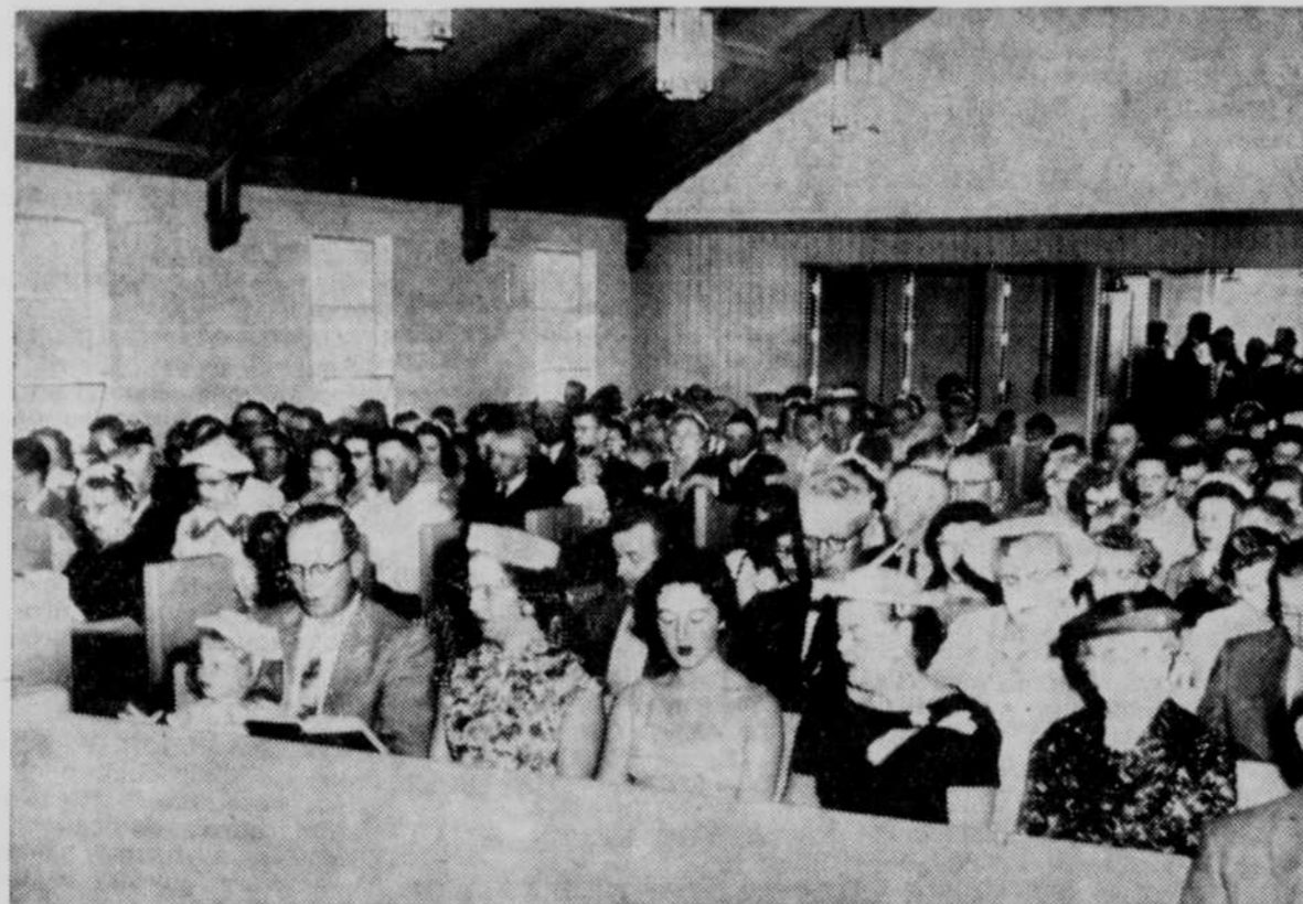
This interior view shows a portion of the crowd attending Sunday's 10 a.m., dedication service at Christ Lutheran church.