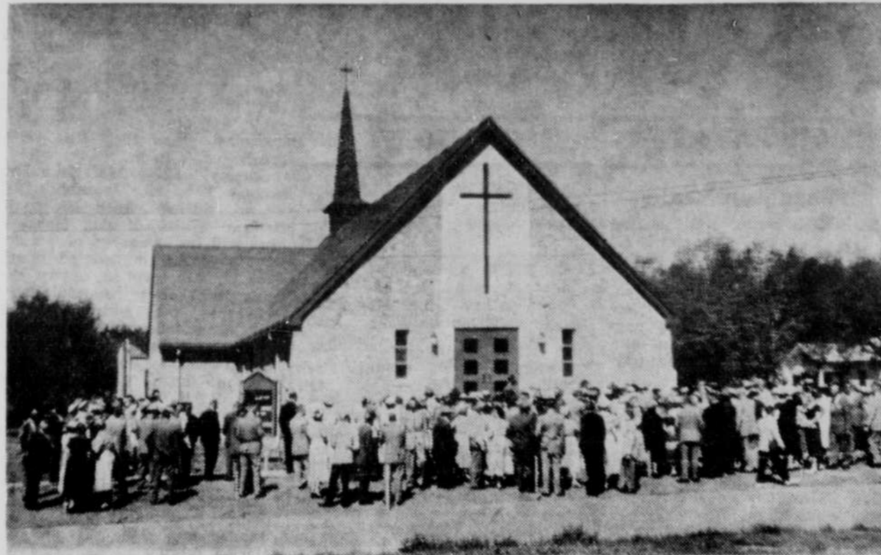
This photo of the new 76-thousand-dollar Christ Lutheran church was taken Sunday morning moments before the doors were formally opened for the first time. The main part of the church and the basement overflowed with parishioners, former members of the parish, visitors and other well-wishers.