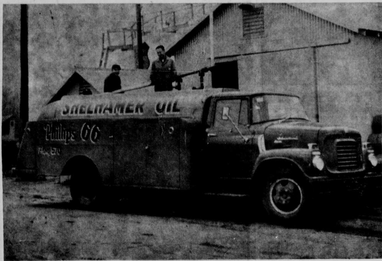
LAVERN — PAUL

For your protection this new Tank Wagon is equipped with the most modern metering units.