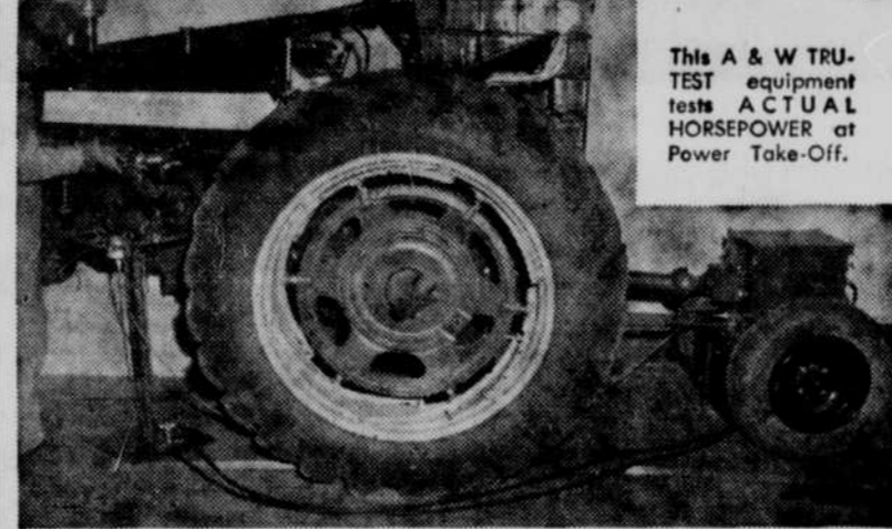
This A & W TRU-TEST equipment tests ACTUAL HORSEPOWER at Power Take-Off.

WE ARE NOW EQUIPPED TO TEST AND SERVICE YOUR TRACTOR FOR Maximum Power Efficiency