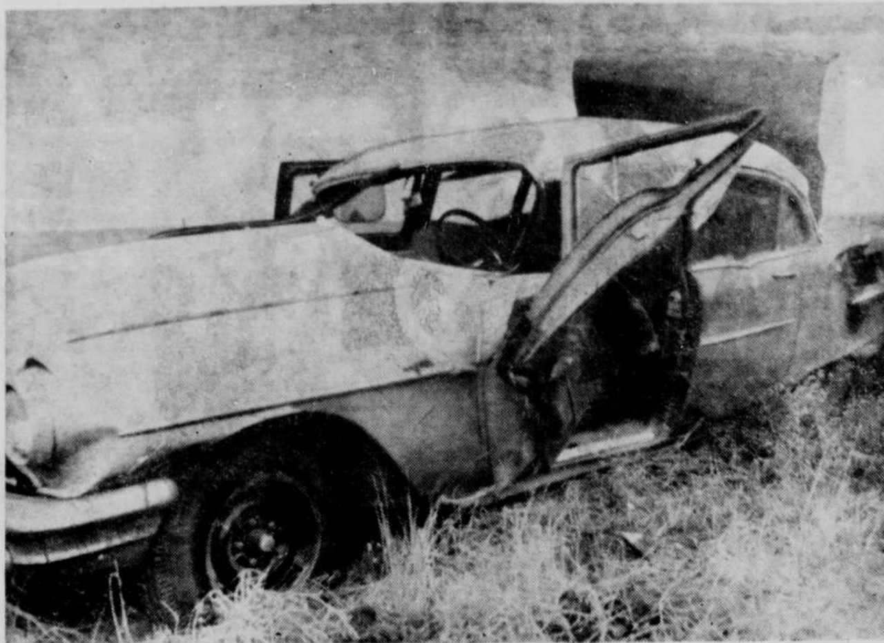
Berger car . . . miraculous escape for lone occupant.

Alice's Beauty Shop Res. 3 doors west of Texaco 125 East Douglas Phone 243 — O'Neill