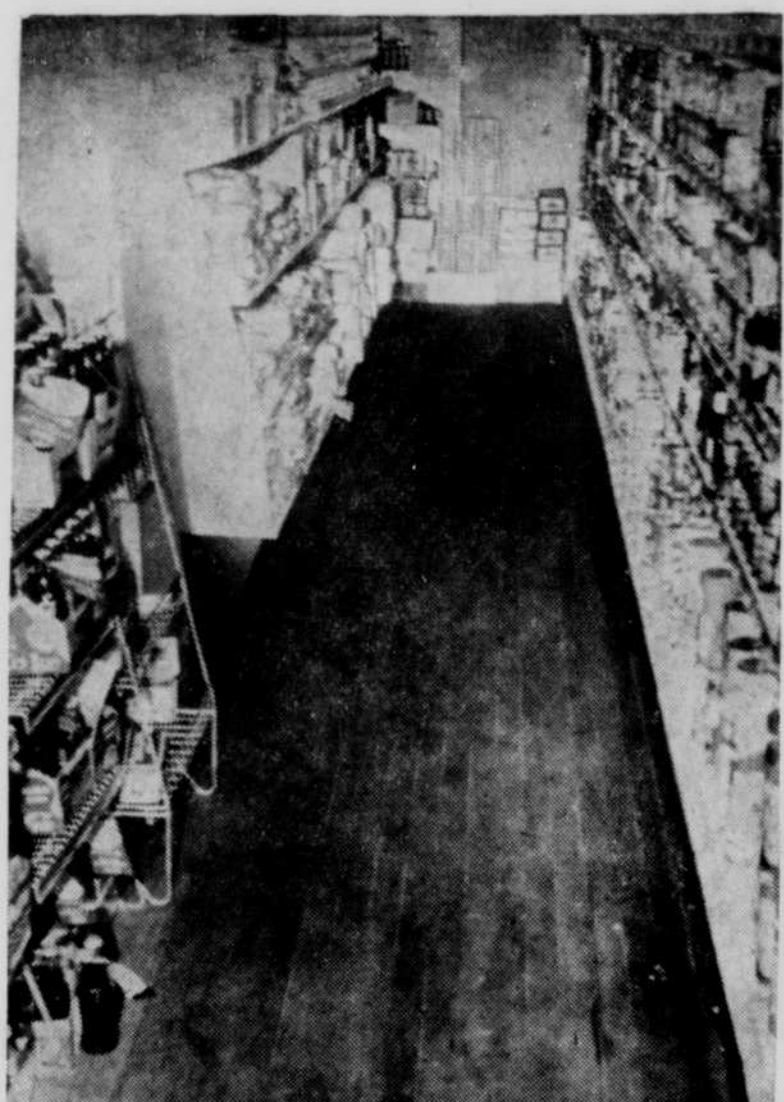
Fourth Street Market—New and the Old