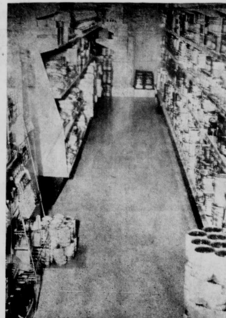
Fourth Street Market—New and the Old

This view of an aisle at the Fourth Street Market presents the contrast of the original wooden floor (left) and a new tile floor (right). The tile flooring and new counter tops were installed for the start of the store's sixth anniversary sale.