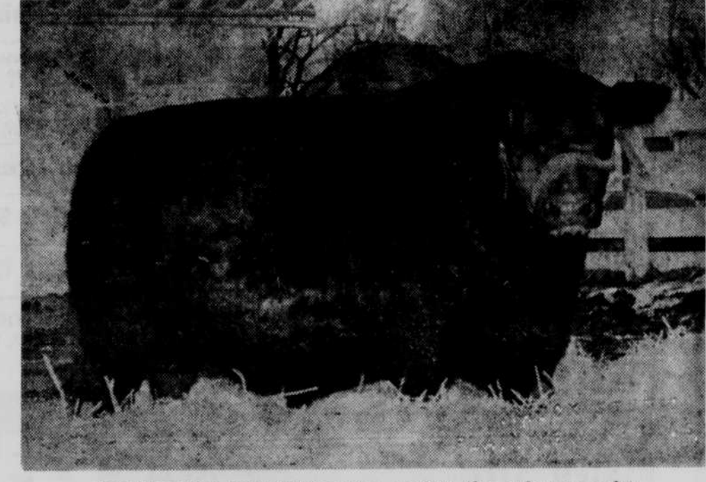
EILEENMERE RAVENLOX 76th 1598228 (for reference only) This bull (above) will not sell. He is sire of two Eileenmere bulls (described at left) which will sell. ALL CATTLE TB AND BANGS TESTED WITHIN 30 DAYS OF SALE