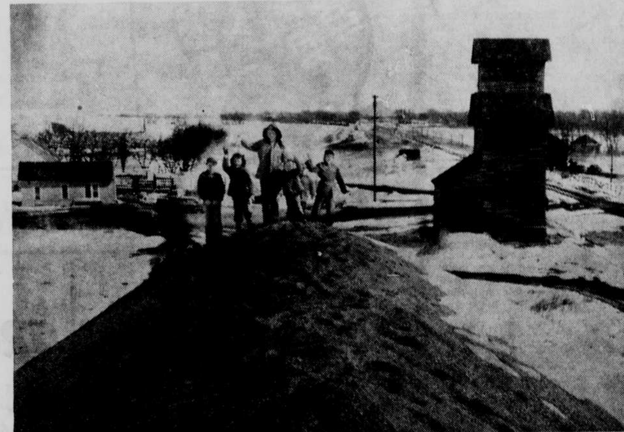
Mountain Comes to Emmet