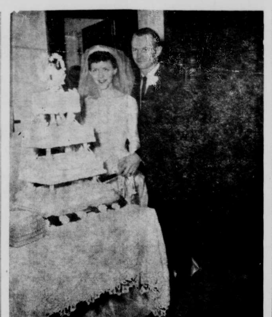
wed in church rites.