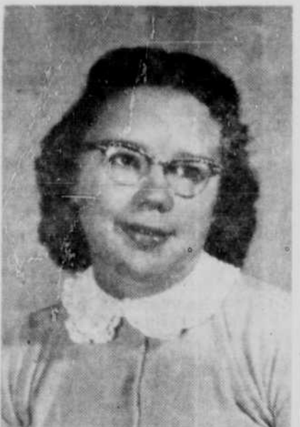
Home for Holidays