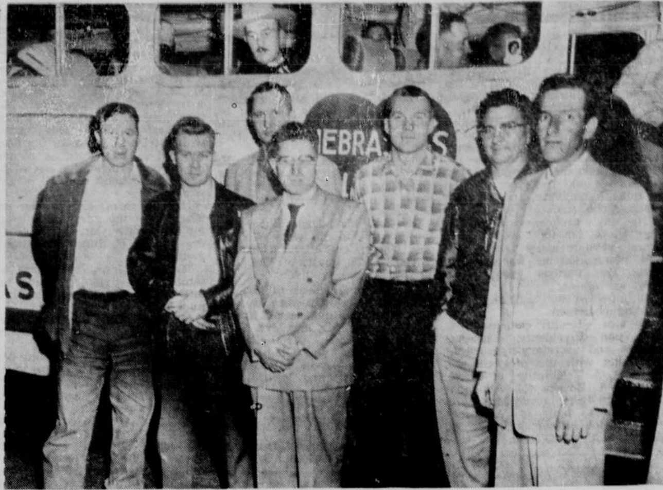
Scout workers . . . Omaha.