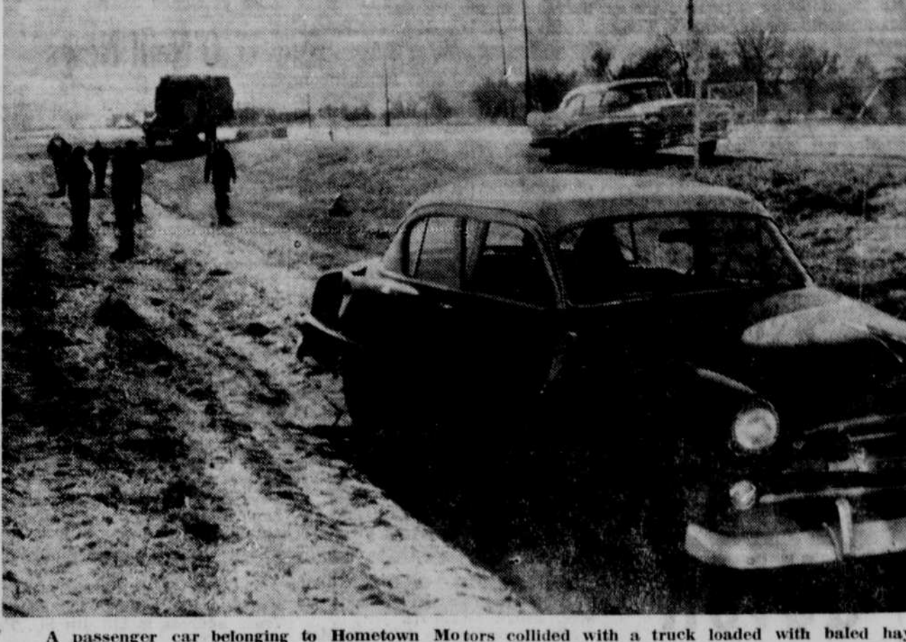
A passenger car belonging to Hometown Motors collided with a truck loaded with baled hay Wednesday noon at the cemetery corner. Driver of the car, Dale Hewitt, suffered a fractured rib.