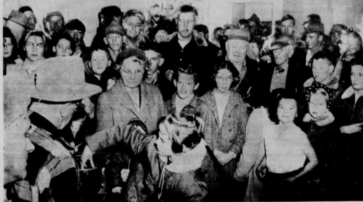
This photo was snapped during Saturday's 4 p. m., distribution of dressed turkeys under sponsor-ship of Chamber of Commerce.