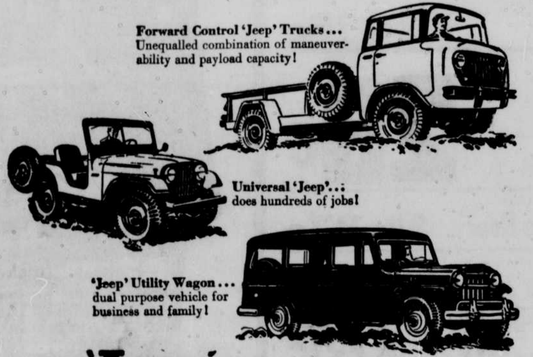
Forward Control 'Jeep' Trucks... Unequalled combination of maneuverability and payload capacity!

Rugged 'Jeep' vehicles save you time and money on job-after-job. They have the extra traction of 'Jeep' 4-wheel drive to maneuver easily where ordinary trucks can't go—through mud, sand, soft earth or over rough, rocky country, in good weather or bad. They shift easily into conventional 2-wheel drive for economical highway travel. With power take-off, these work-horse vehicles operate a wide variety of special equipment. And their rugged stamina stands up under the toughest use 365 days a year. Today!—make a date to see and drive the 'Jeep' vehicle that's right for your jobs.