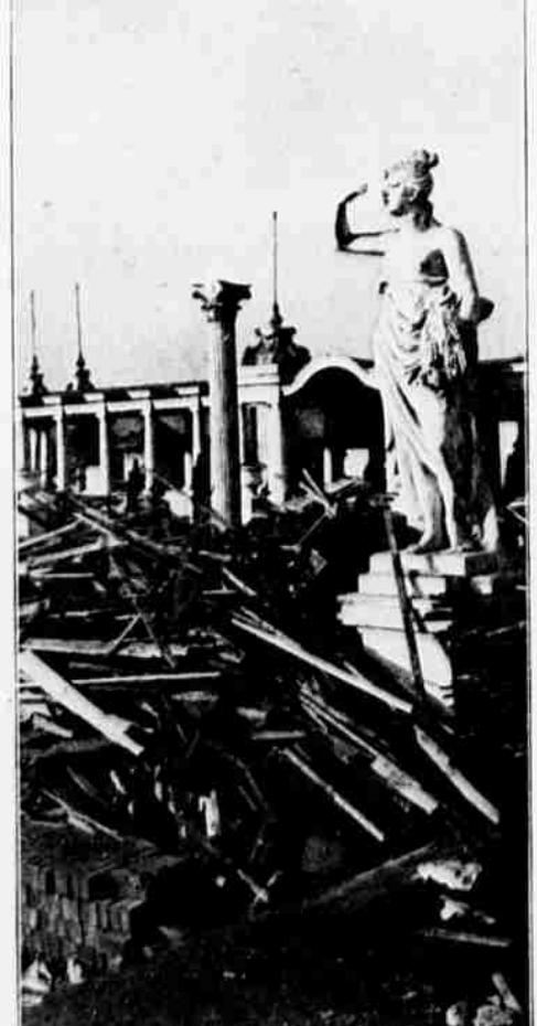
WRECKING THE EXPOSITION-CERES VIEWING THE RUBBISH HEAP

inmates of benevolent and reformatory intration areas; to social statistics of cities; and expenditures; to religious bodies; to electric light and power, telephone and telmines, mining and minerals, and the pro-