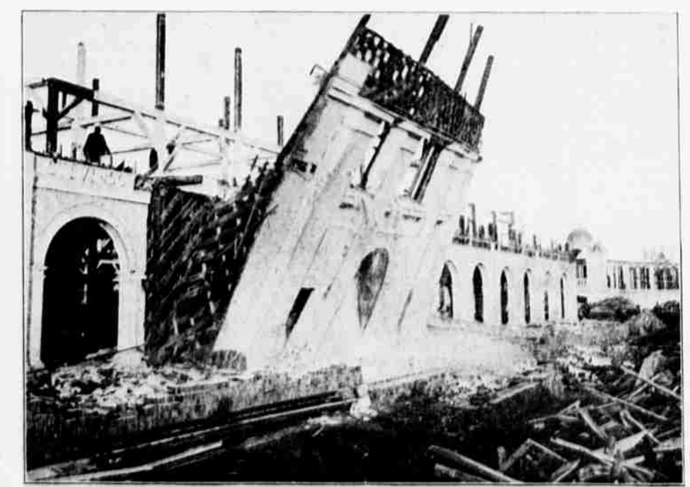
WRECKING THE EXPOSITION-FALLING OF SOUTH ENTRANCE OF MACHINERY HALL-Photo by Louis R. Bostwick