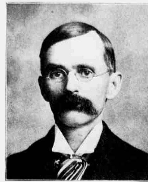
TRICT CENSUS SUPERVISOR.