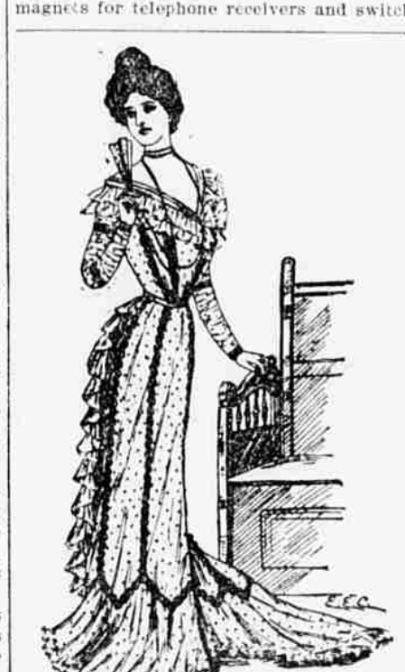
QUIET, BUT ELEGANT DINNER DRESS.

A host of women and many young girls are employed in the large manufactories of electric goeds. They make all the filaments for the lamps. They wind the armatures for the dynamos. They wind and cover with spun silk or paper miles and miles of wire, small and large, used in the induction coils, in the great underground cables and on the magnets for telephone receivers and switch-