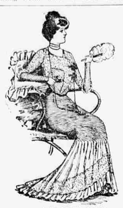
THE DEBUTANTE'S GOWN.

sprinkled flowers, and quite as pretty, and I took note that all the girls that may proptisaue, in tints so pale that they merely suggested color. That is distinctly a French fashion, and I privately commented on the numbers of buds whose sole jeweled two localties. The figures represent girls of ornaments were pins in the form of sprays or stars, fastening narrow neck bands of ports the Philadelphia Times, and unless black velvet, the ends of which crossed in there are some marked differences throughfront over the young and pretty collar bone out the districts from which the institutions points and contrasted dazzingly with the draw their students it would be safe to as-