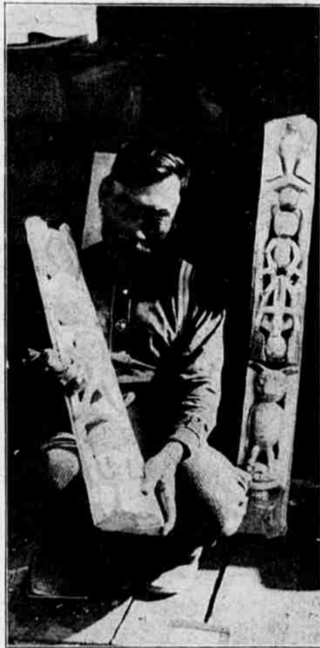
MAKING TOY TOTEMS.

The big totem above is a human figure with the Georgia mud complexion over his entire body. His face is very expressive, but the expression is difficult to decipher. His mouth is stretched well towards where his ears ought to be in what was originally a