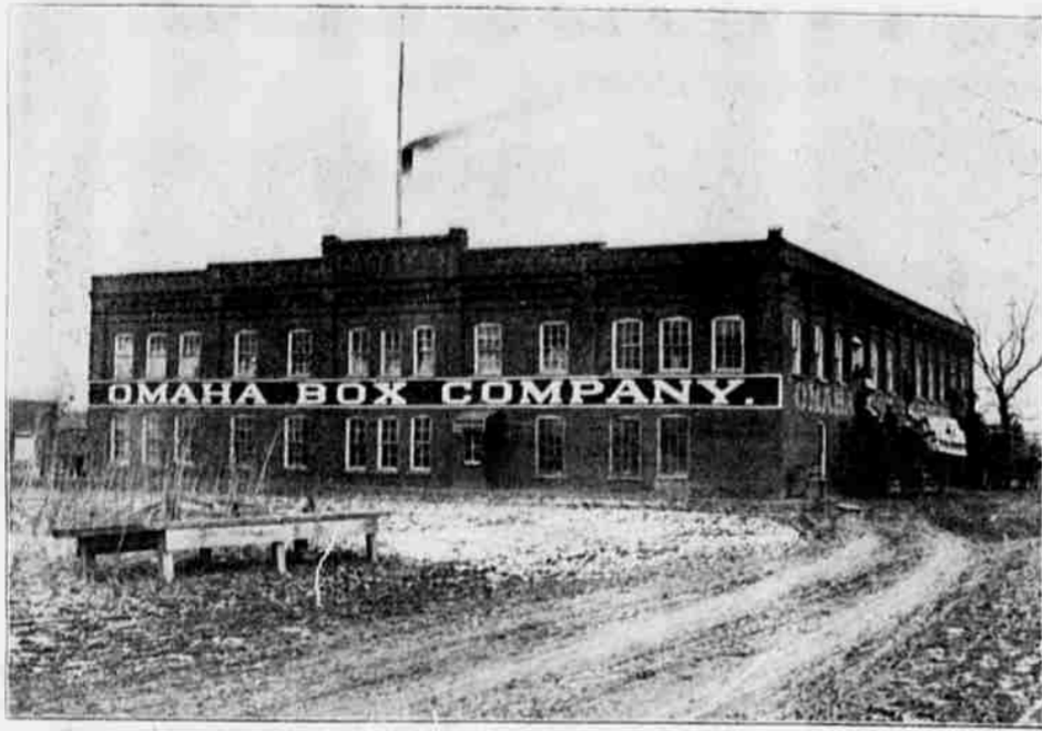
FACTORY OF OMAHA BOX CO.