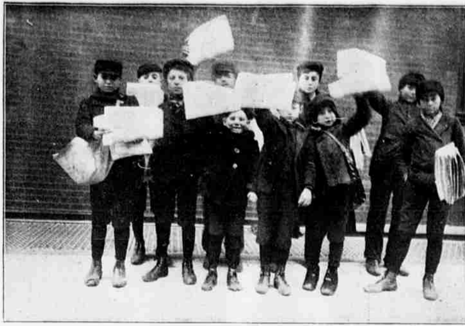
"HERE'S YOUR OMAHA ILLUSTRATED BEE"