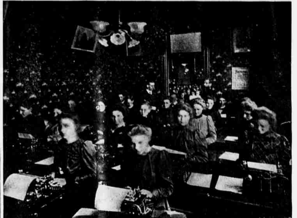
SECTIONAL VIEW OF ONE TYPEWRITING ROOM.

Owing to the increased attendance in the shorthand and typewriter department, we have added $1,000.00 worth of new Smith-Premier Typewriters, latest model, giving our pupils every possible advantage, fitting them for positions for which we have daily calls.