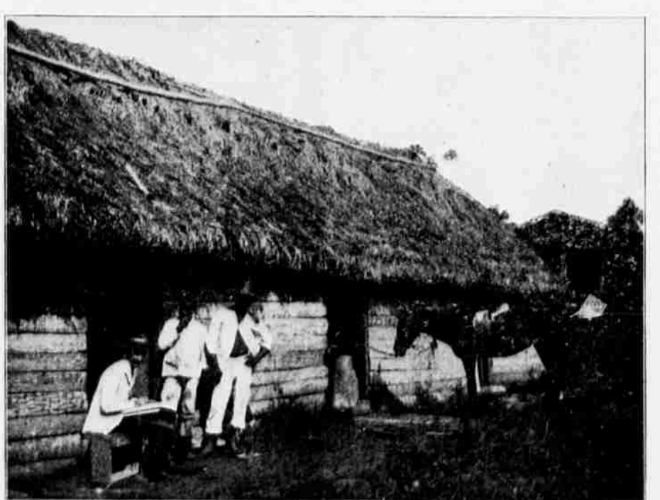
CUBAN CENSUS ENUMERATOR AT WORK.

As a consequence, the work of the enufranchise qualifications—as to illiteracy, merators, of whom there are 1,600 in Cuba, was looked upon with extraordinar inter-