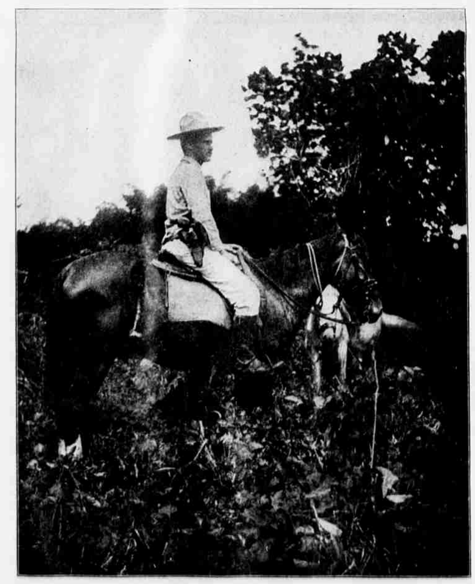
CENSUS ENUMERATOR IN CUBAN JUNGLE.

Never before was there such a census in Cuba. The old Spaniards had their regular unreliable, some districts, particularly in thousand and one delicate questions concensus years, but their methods of making the country, being wholly unenumerated. the enumerations were quite characteristic, A grand supervisor with an army of Spanish