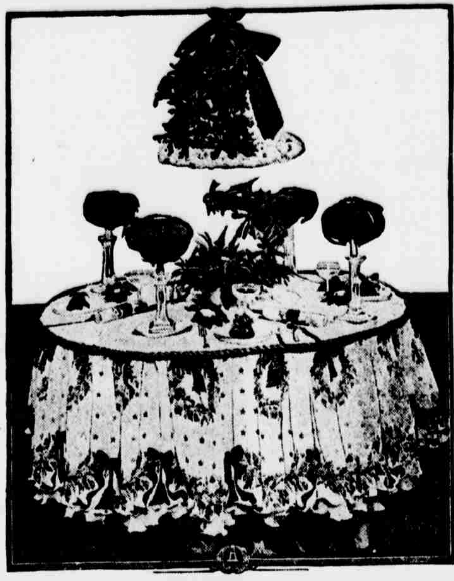
A Christmas Dinner Table.

very word expresses the is the embodiment of joy and a small bow of red baby ribbon. mirthfulness, a glorious day of gaiety and merriment for old and young. Let us all be children at Christmas time, and enter into the preparations and plans for the day with youthful fervor.