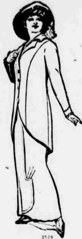
Copyright 1911 by The H. Black Co.

An assemblage of handsome styles are here for your inspection. Come in and see them whether you intend to purchase or not.