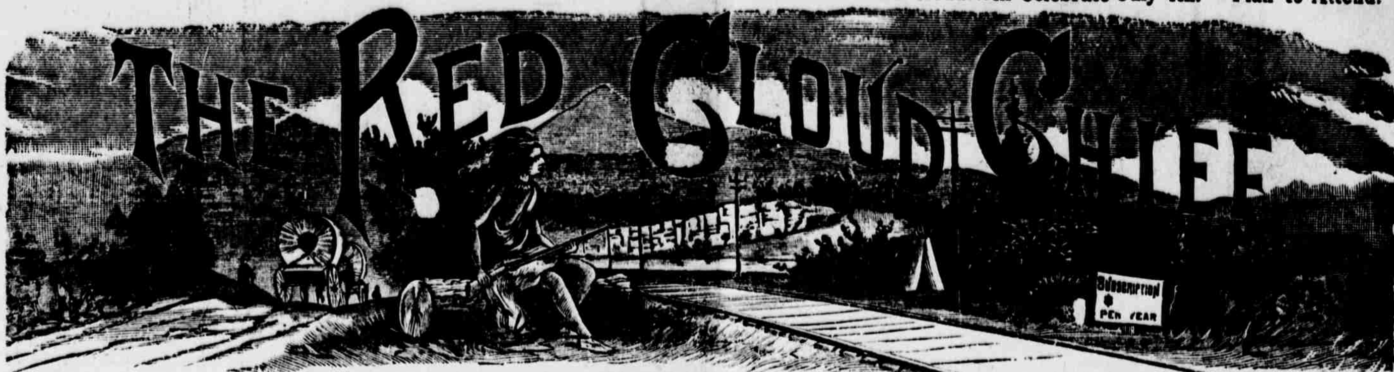
A Newspaper That Gives The News Fifty-two Weeks Each Year For $1.50.